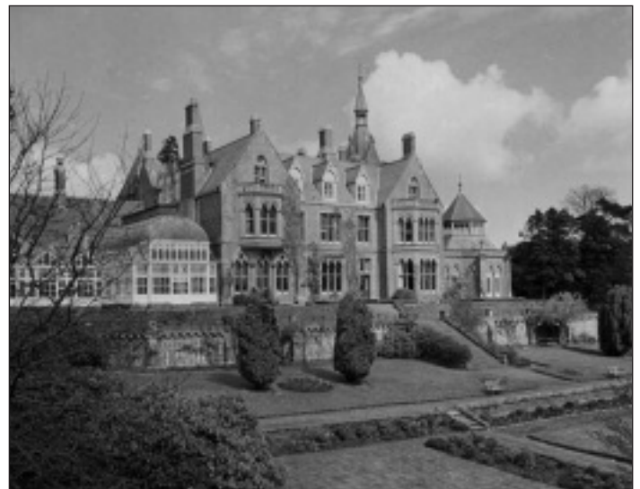
Hafodunos in 1954

For any building of importance it is essential that a fire-risk assessment by the local fire brigade should be in place in anticipation of a similar disaster. Conscientious owners will have undoubtedly thought of this and sought appropriate advice. But there is scope for concerned amenity groups such as